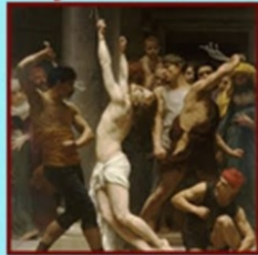
The Scourging at the Pillar