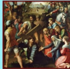
The Carrying of the Cross