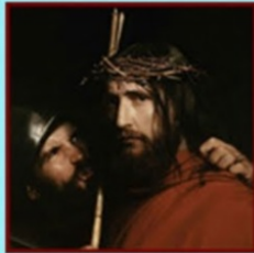
The Crowning with Thorns