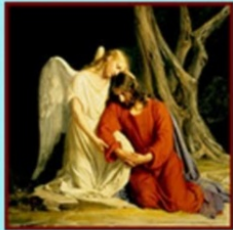
The Agony in the Garden