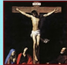
The Crucifixion and Death of Our Lord

This week we will be focusing on the Sorrowful Mysteries prayed on Tuesday and Friday. These mysteries call us to meditate on the passion and death of Jesus. They remind us of the immense love God has for us. We are invited to appreciate the mystery of Christ's passion and death and how it applies to our own lives today.